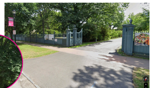
Bus loop entrance from the East