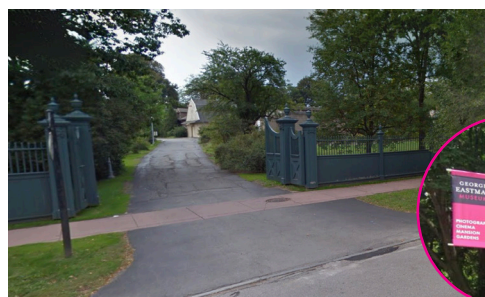
Bus loop entrance from the West