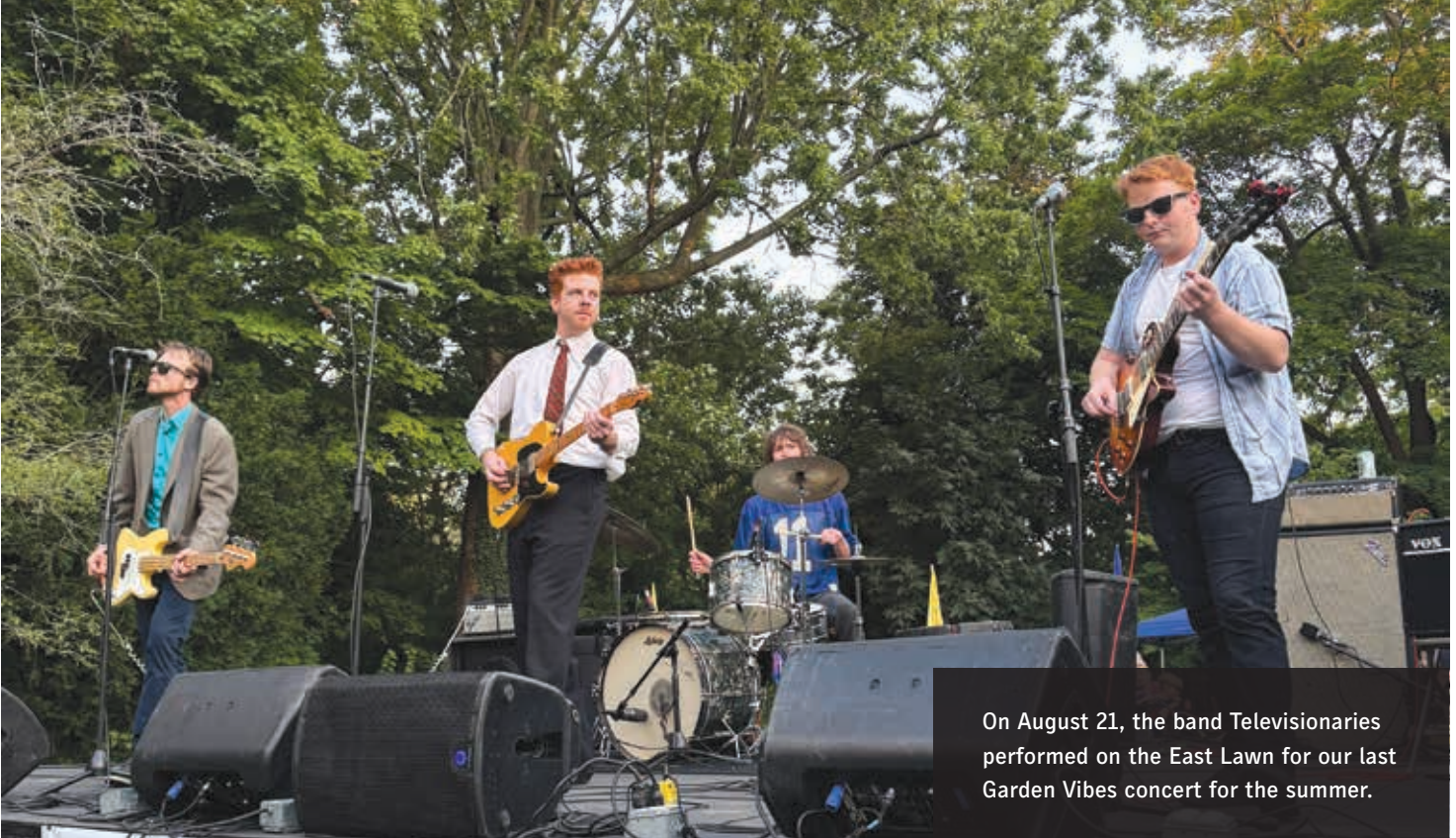
On August 21, the band Televisionaries performed on the East Lawn for our last Garden Vibes concert for the summer.