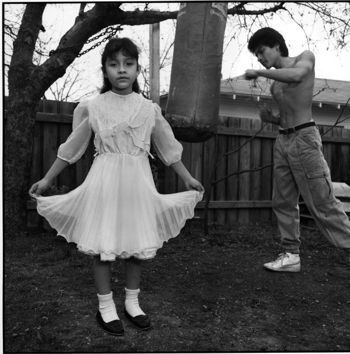
Mary Ellen Mark (American, b. 1940). Hispanic Girl with Her Brother, Dallas, Texas, 1987. From the series Urban Poverty. Gelatin silver print. George Eastman Museum.