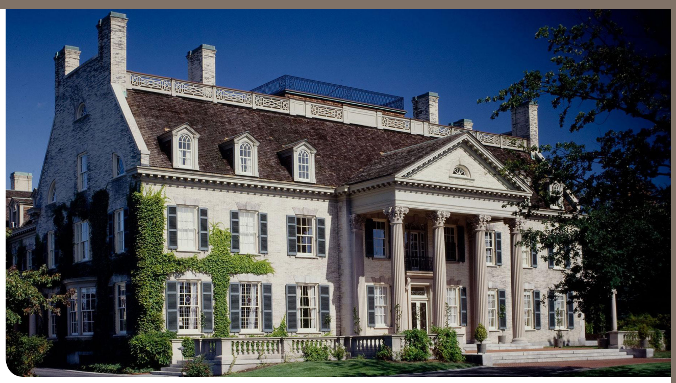
George Eastman Museum

Have lunch and be immersed in historic and modern art at the George Eastman Museum, which is located on the estate of George Eastman, the pioneer of popular photography and motion picture film. First, fuel your appetite at Open Face at Eastman Museum. Open Face features a menu of inclusivity in their hand-crafted specialty items offering sandwiches, soups and salads. Gluten-free,